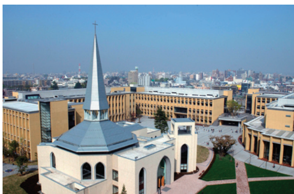
Wesley Chapel (Sagamihara Campus)

Aoyama Gakuin University offers six undergraduate programs and has six graduate schools and three specialized graduate schools. It has a total of 19,000 students of whom 1,400 are studying in graduate school courses. The University's two main campuses are Aoyama Campus, located in Shibuya Ward, Tokyo, and the Sagamihara Campus, where members of the JSAP will gather for the Spring 2007 meeting.