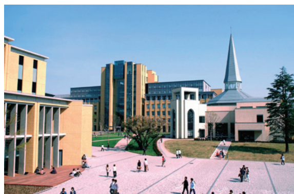
Media center (Sagamihara Campus)