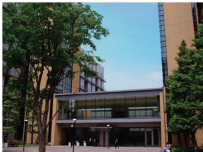
Center for Advanced Technology (Sagamihara Campus)

The 2007 Spring Meeting of the Japan Society of Applied Physics 2007 will be held from March 27 to 30, at the Sagamihara Campus of Aoyama Gakuin University in Sagamihara City. The Campus is readily accessible, being 40 minutes from the international port city of Yokohama and 40 minutes from Shinjuku, one of Japan's most well-known commercial districts in central Tokyo.