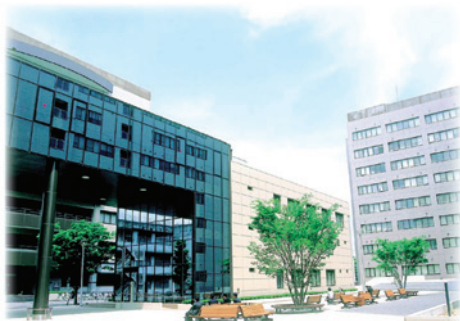
The University of Tokushima

The 2005 JSAP Fall Meeting will be held at the Josanjima Campus of The University of Tokushima, September 7 th to 11 th , 2005. The University is located in Tokushima City, on the northern coast of Shikoku island, about one hour from Tokyo's Haneda airport.