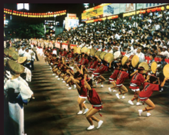
Awa Odori dance