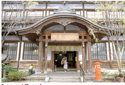
Spa resort (Beppu)