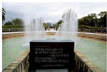
Peace Park (Nagasaki)

Other famous sites in Kyushu include the city of Nagasaki, famous for the Peace Park and Glover House, said to have been the inspiration for Puccini's opera Madame Butterfly; the spa resort of Beppu in Oita City; and the active volcanoes Unzen, Aso and Sakurajima.