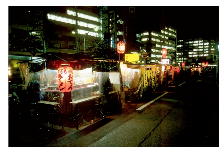
Yatais: open air food stalls (Tenjin)